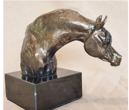
$50 AWARD – ARAB BRONZE BUST VIEW RIGHT SIDE