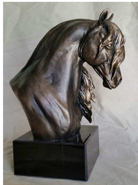
$60 FRIESIAN BRONZE BUST VIEW RIGHT SIDE