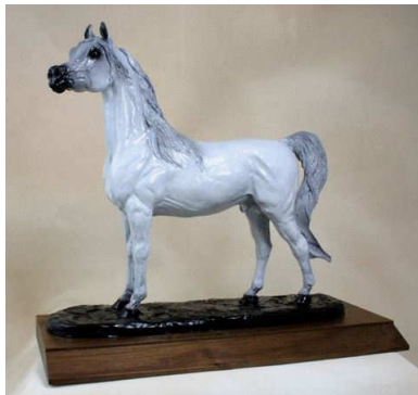
$120 AWARD - ARAB