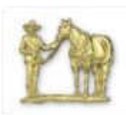
477 Showman & Horse small