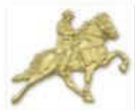
813 Male Racking Horse