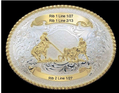
BUCKLE- 2933 TROPHY AWARD 3-3/4" X 5"