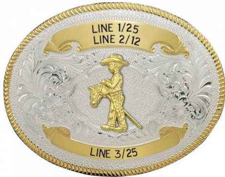
$110 - MON843