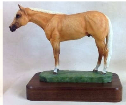
$120 AWARD - PALOMINO