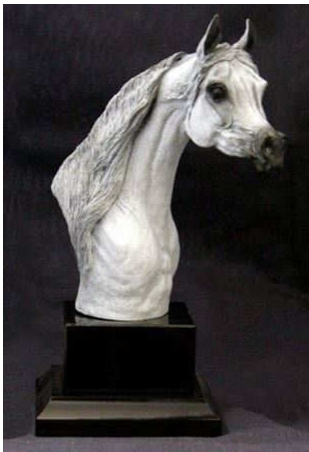
$80 AWARD – ARAB