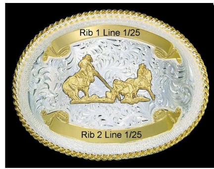
BUCKLE- 1252 TROPHY AWARD 2-1/2" X 3-1/2"