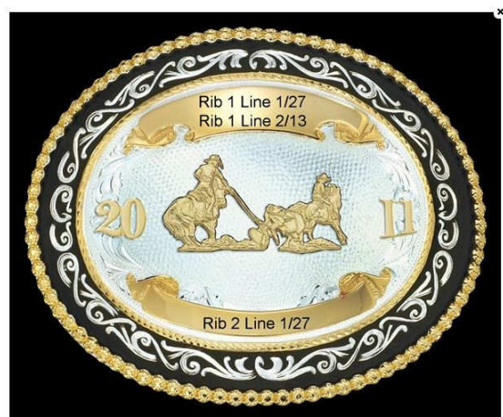
BUCKLE- 7543 TROPHY AWARD 4" X 5"