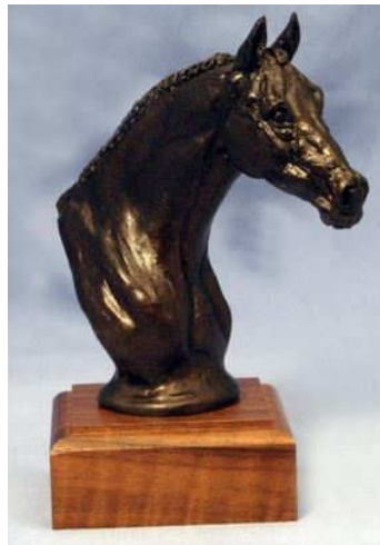
$50 AWARD – HUNTER (AVAILABLE COLORS BELOW)