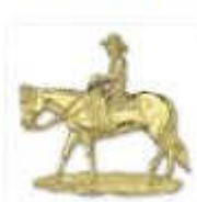
449 Pleasure Horse