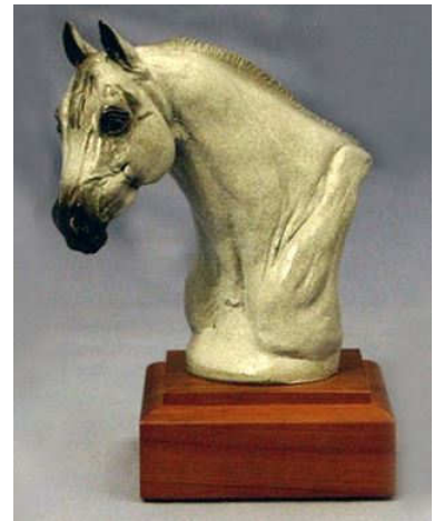
$50 AWARD – QUARTER HORSE (AVAILABLE COLORS BELOW)