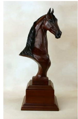
$80 AWARD – GAITED