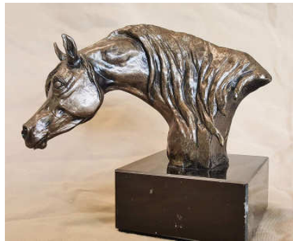
$50 AWARD – ARAB BRONZE BUST VIEW LEFT SIDE