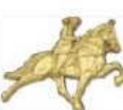
824 Female Racking Horse