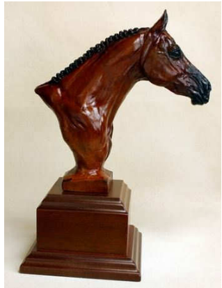
$80 AWARD – HUNTER