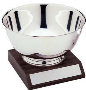
$40, $60, $80 & $100 AWARDS (4" - 6" - 8" - 10")