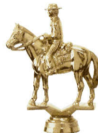
WESTERN WITH RIDER