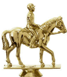
HUNTER HORSE W/RIDER