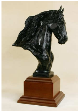
$100 AWARD – FRIESIAN