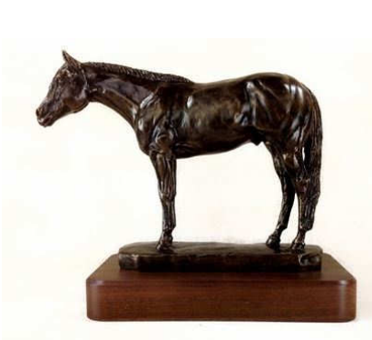
$120 AWARD - QH