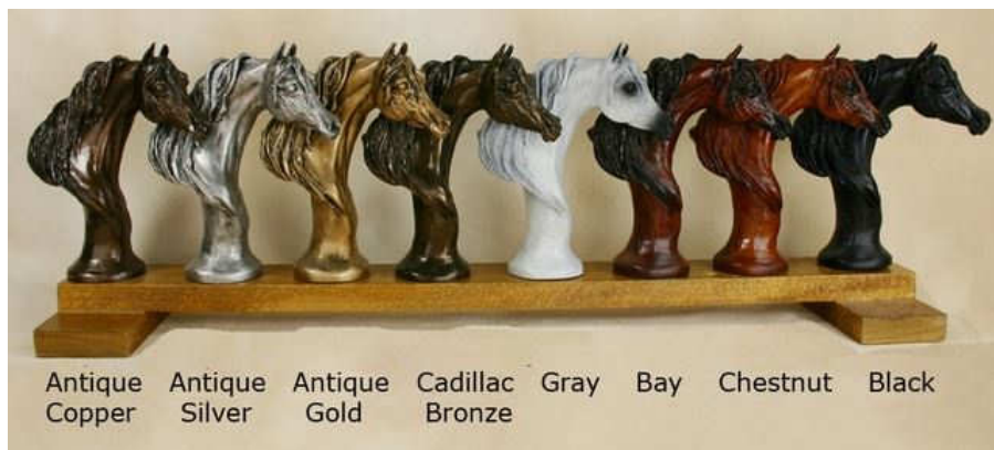
Antique Copper Antique Silver Antique Gold Cadillac Bronze Gray Bay Chestnut Black