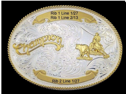
BUCKLE- 943 TROPHY AWARD 3-3/4" X 5"