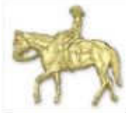
566 Trail Horse