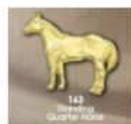
163 Standing QH