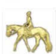
224 English Rider