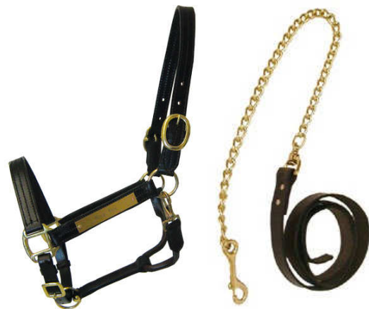
$60 AWARD - Halter & Name Plate with Lead