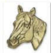
164 Horse Head