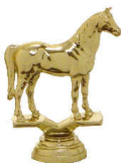
QH WITHOUT SADDLE