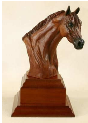
$80 AWARD – QH