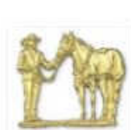
476 Showman & Horse