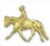
551 English Rider small