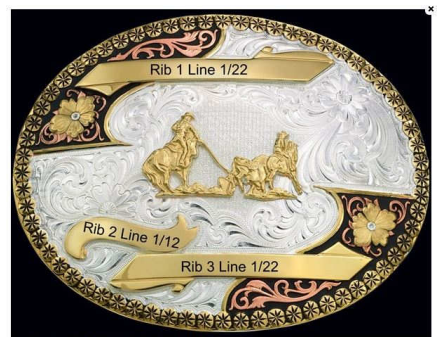
BUCKLE- 61340 TROPHY AWARD 3-3/4" X 5"