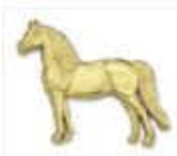
803 Morgan Horse