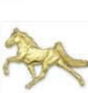
425 Tenn. Walker