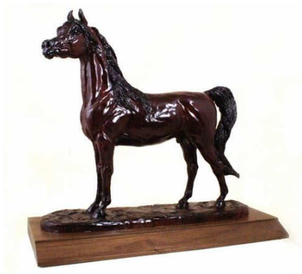
$120 AWARD - ARAB