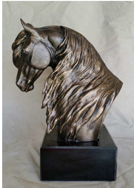
$60 FRIESIAN BRONZE BUST VIEW LEFT SIDE