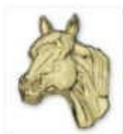
44 Quarter Horse Head