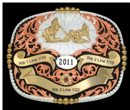
BUCKLE- 61325 TROPHY AWARD 3-5/8" X 4-5/8"