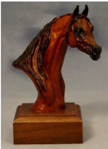
$50 AWARD – ARAB (AVAILABLE COLORS BELOW)