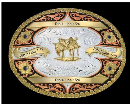
BUCKLE- 61323 TROPHY AWARD 3-3/4" X 5"