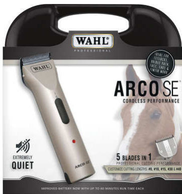
$125 Wahl Arco SE Cordless Clipper