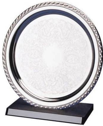
$50 & $60 Silverplated Tray (10" & 12")