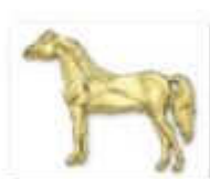
512 Arabian Horse