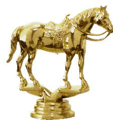
QH WITH SADDLE