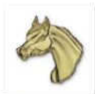
25 Arabian Horse Head