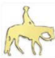
144 Horse & Rider Silhouette