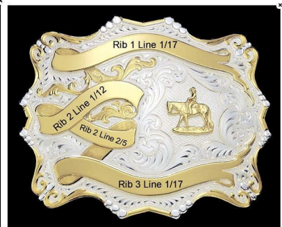
BUCKLE- 10704 TROPHY AWARD 3-3/4" X 4-5/8"