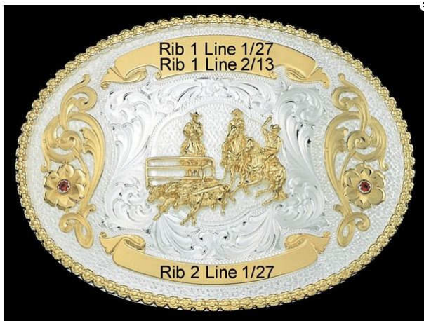
BUCKLE- 2133 TROPHY AWARD 3-3/4" X 5"