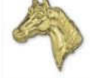
835 Horse Head